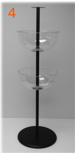
4 Repeat Steps 2 & 3 to add the second Bowl