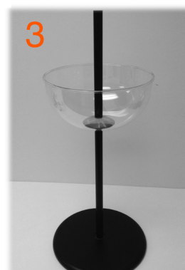
3 Place a Bowl onto the Support Plate and attached Bowl Rod by screwing in a Bowl Rod