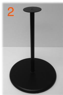
2 Place Support Plate on top of the Base Rod