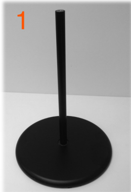
1 Screw Base Rod into the base, ensure Rod is tight