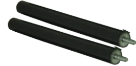
Bowl Rods (labeled B) x 2