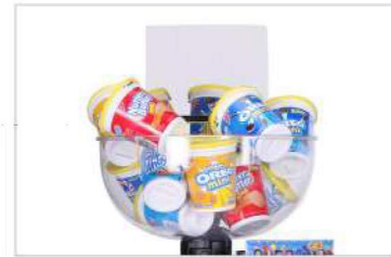
Available with Display Bowls