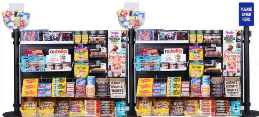
Multiple panels can be connected to make a run of any size