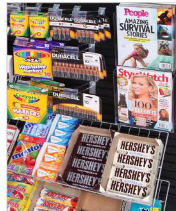
Wide range of accessories