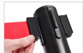
Belt Lock to prevent accidental belt release