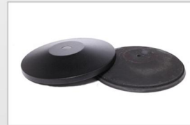
Cast iron base with replaceable cover