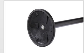
Full circumference rubber floor protector