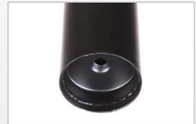
Steel/Stainless Steel Post