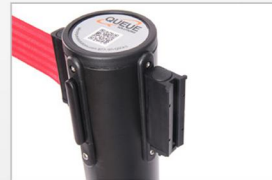
Universal belt end connects to all major brands