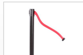
Brake for slow and safe belt retraction