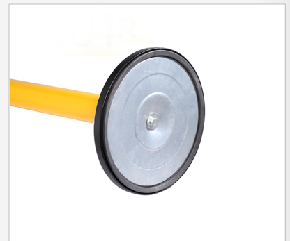
Full circumference floor protector