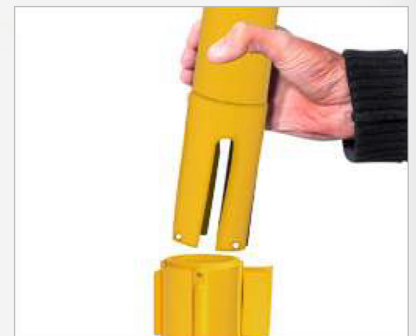
Easy lower cassette replacement