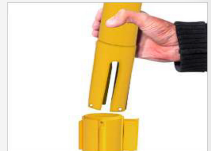
Easy lower cassette replacement