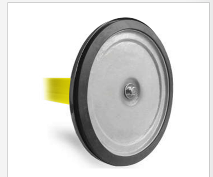
Weatherized cast iron base