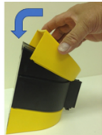
BELT LOCK RELEASE