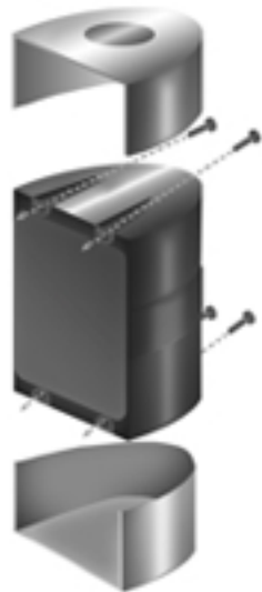
INSERT BELT END (LOCKS AUTOMATICALLY)