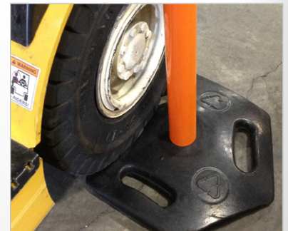
Tough recycled rubber base