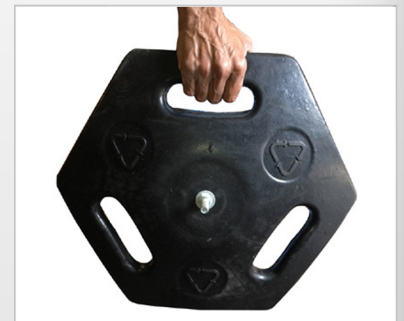
Convenient carry handle