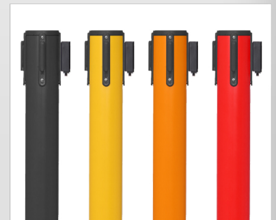
Available in black, yellow, orange, and red.